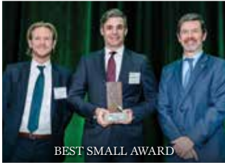
BEST SMALL AWARD