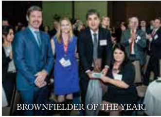
BROWNFIELDER OF THE YEAR