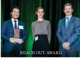
REACH OUT AWARD