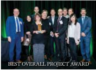
BEST OVERALL PROJECT AWARD